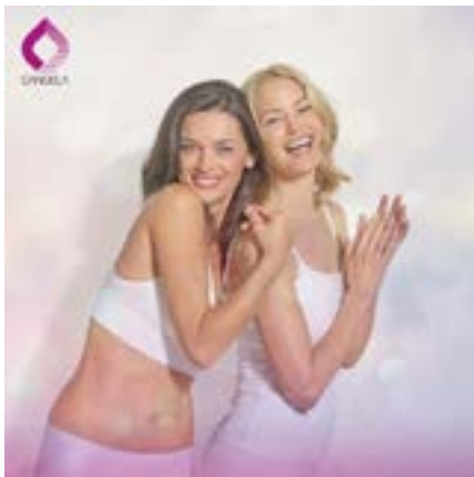
Part of the Candela Family

Finding content to share may feel like a daunting task, which is why we've included six pre-designed and approved content to get you started. Simply use the picture & text provided and post this on your social media channels. As an added benefit, you could also use the hashtag list on the previous pages.